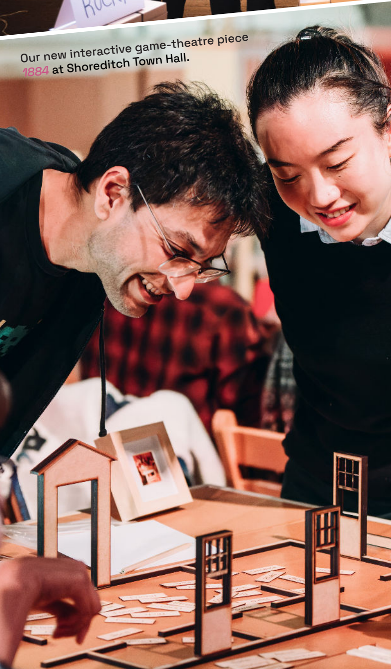
Our new interactive game-theatre piece 1884 at Shoreditch Town Hall.